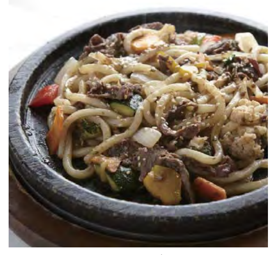
LUNCH "MYUN" $15 런치볶음면 ♥ (~ (((

KOREAN STIR FRIED NOODLE SERVED WITH: SALAD WITH FARO DRESSING 샐러드 5 SIDE DISHES 밑반찬