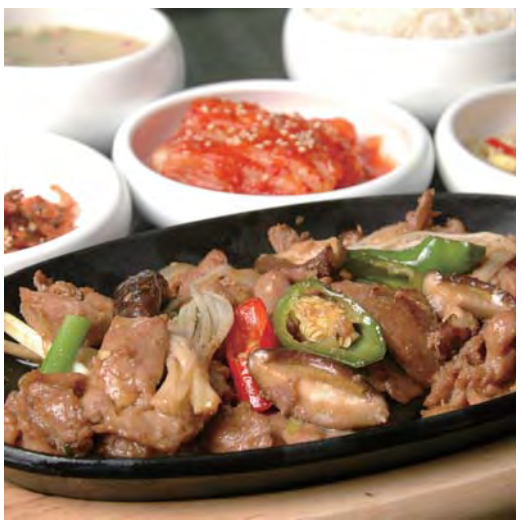
LUNCH "SU:T" $15 런치철판구이

RICE & KOREAN BBQ GRILL PLATE SERVED WITH: SALAD WITH FARO DRESSING 샐러드 PICKLED SLICED RADISH 쌈무 5 SIDE DISHES 밑반찬