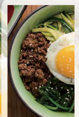
BIBIMBAP $14 비빔밥 () (

VEGETABLES & CHILLI PASTE - SERVED WITH 7 SIDE DISHES & RICE