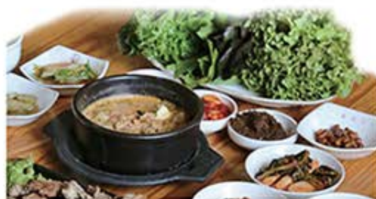
TABLE SET 상차림세트

ONLY AVAILABLE AS AN EXTRA FROM KOREAN GRILL OPTION